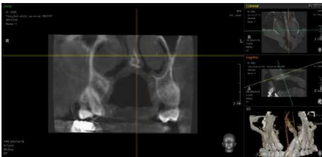
Figure 7: Pre-operative Cone Beam Computed Tomography (CBCT).

After extensive review and reading in references and periodicals, we haven't found a new innovative way to treat such a condition, which forced us to think about creating a novel method by designing a new device to close the cleft palate for this patient.