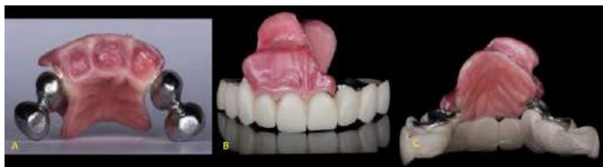
Figure 2: Telescopic crowns on which the new obturator design (novel method) was attached after coating with porcelain A, Telescopic crowns on with obturator and temporary restoration frontal view B, and palatal view C.