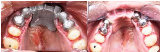
Figure 1: Intraoral view for telescopic crowns on which the new obturator design (novel method) was attached before coating with porcelain.

palate involve removable obturator supported by the alveolar ridge and retained with clasps around the teeth, magnetically retained obturator [7-9]. In the present case, we used fixed telescopic crowns which are part of the obturator coated with porcelain, and then a full-arch fixed prosthesis was placed over the telescopic crowns and obturator (Figure 1 and 2).