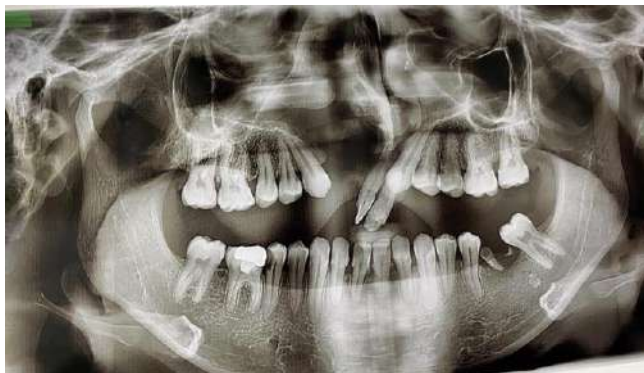
Figure 6: Pre-operative Panoramic Radiograph.