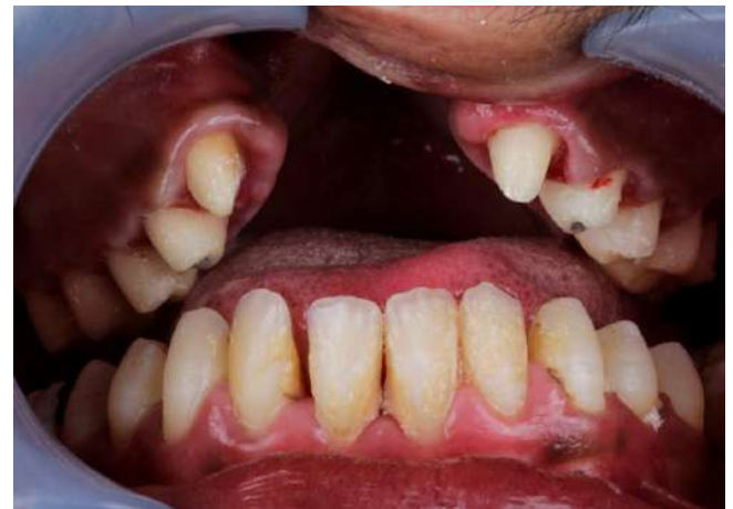
Figure 8: Showing the preparation of upper maxillary teeth after removal of maxillary central incisors.

A decision was made to remove the maxillary central incisors with part of the underlying bone to facilitate the preparation and placement of a fixed prosthesis in the upper jaw (Figure 6). Periodontal, restorative, and root canal treatment were performed prior to the preparation of maxillary teeth, followed by oral hygiene instruction. After preparing the maxillary teeth, conventional and digital impressions of the upper and lower jaws were taken. The canines and the first premolar teeth were chosen to receive the telescopic crown on which the obturator was attached. Temporary restoration with acrylic obturator was placed and the patient asked to try it for 2 weeks. No Oroantral Communication (OAC) was observed while the patient is blowing, eating, or drinking.