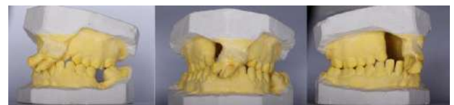
Figure 4: Pre-operative conventional study models.

The treatment procedure started by collecting data (Personal, Physical, Medical, and Dental History). A consent Letter was obtained prior to starting treatment procedures. Multidisciplinary Treatment Team (MTT) represents the cornerstone of the treatment plan which consists of different dental specialists. The clinical procedures were started by taking conventional and digital Impressions (Figure 4 and 5) followed by panoramic and CBCT radiographs (Figure 6 and 7).