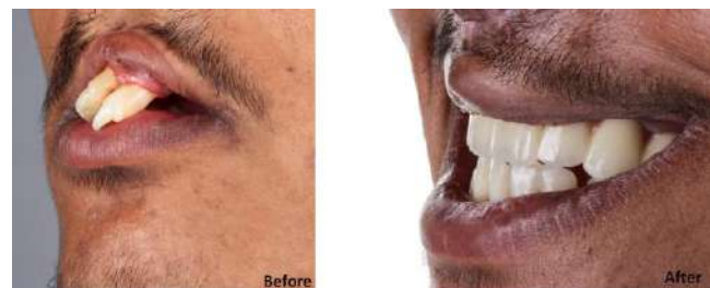
Figure 10: Final result before and after.

It is not easy to treat speech in patients with longstanding untreated clefts [4,5].